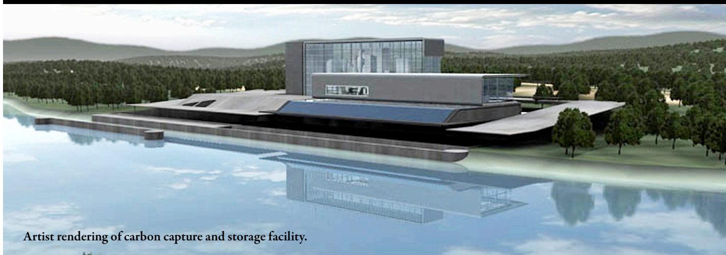
Artist rendering of carbon capture and storage facility.

Since 2005, US$25 billion in direct government funding for CCS has been announced worldwide, with 80 percent of these announcements focused on support for large-scale CCS demonstration projects. 6 While not all of these announcements have resulted in distribution of public funds, the magnitude of government investment has been large, with the United States, Canada, Australia, and Norway among those with the largest public commitments to CCS. Although the global financial crisis has contributed to the cancellation or delay of several projects, 7 it also resulted in some increases of funding in the United States because the 2009 American Recovery and Reinvestment Act committed more than US$3.1 billion to CCS.